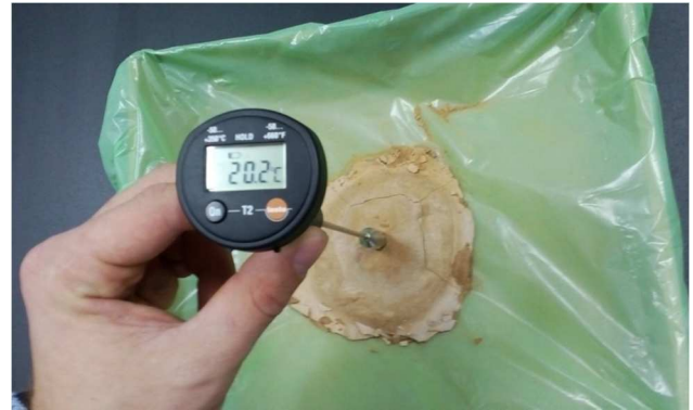
Figure 2 Displaying the the magnesite powder coating layer on the surface of the RFID transponder 20 mm thick with the addition of water in a 1: 1 (g / ml)

A.4 - applying a layer of the magnesite powder to the surface of the RFID transponder 20 mm thick with the addition of water in a 1: 1 (g / ml).