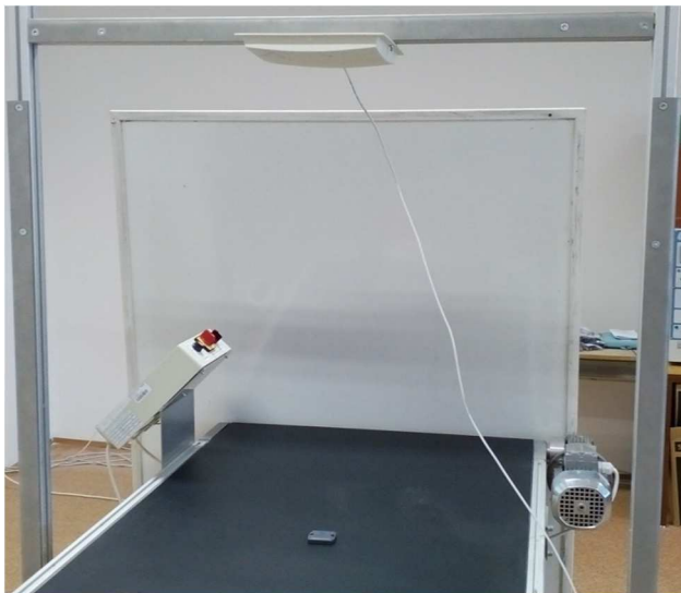
Figure 1 Displaying the configuration measuring elements

RFID antenna located at a distance of 1 m from the RFID transponder.