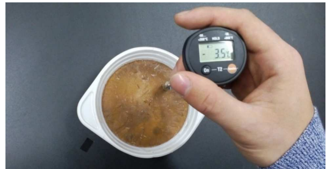
Figure 3 Displaying the the magnesite powder coating layer on the surface of the RFID transponder 20 mm thick with the addition of water in a ratio of 1: 1 (g / ml), followed by freezing at -3.5 ° C

A.6 - applying a layer of the magnesite powder to the surface of the RFID transponder 20 mm thick with the addition of water in a 1: 1 (g / ml), followed by freezing at -3.5 ° C.