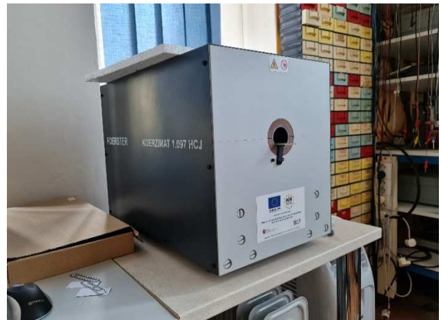
Figure 6 Foerster KOERZIMAT 1.097 HCJ (in Institute of Physics, Faculty of Science, P. J. Šafárik University in Košice)

Results of coercivity evolution of Fe/SiO 2 powders and compacted samples with increasing BPR from 3 to 9 are shown in Figure 7 and Table 2. These graphs represent correlation between intensity of iron granules milling (BPR) and the compaction at high pressure to ring-shaped samples with coercivity value. This means that after pressing we could not just have made a constant shape of SMCs material, but also removed some of inner structural defects.