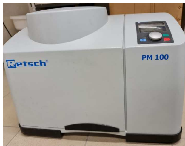
Figure 1 Planetary ball mill Retsch PM100 (in Institute of Physics, Faculty of Science, P. J. Šafárik University in Košice)

Mechanical milling is a process that requires the optimization of several parameters, such as type of mill, milling speed, time of milling, type and size of milling medium, ball to powder ratio (BPR), atmosphere and temperature of milling. These parameters are not completely independent of each other and their use results from the nature of the grinding process. The weight of the milling balls to the weight of the powder (BPR - Ball to Powder Ratio) has a significant effect on energy, performance and milling time. The higher this ratio, the shorter the milling time required to achieve the desired state. The mechanical milling could be possibly made in different types of mills (planetary ball mills, vibratory mills, mixer mills, rotor mills, knife mills, etc.), but for our experiments we choose planetary ball mill PM100 from Retsch (Figure 1), because of its powerful and quick milling with speed control, which makes possible to make a reproducible result for each sample.