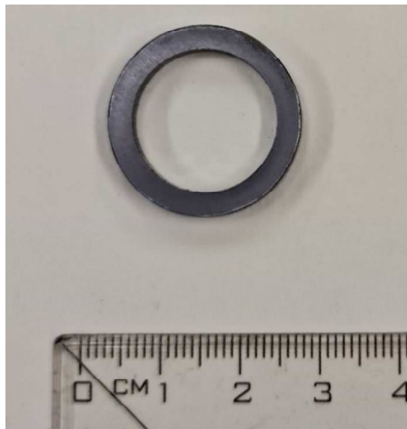
Figure 5 Compacted ring-shaped SMCs iron samples

In our case, samples were compacted for 3 minutes at 400 °C up to 700 MPa. Thus prepared powder (Figure 2 a) and compacted SMCs iron samples (Figure 5) were used for the determination of the coercivity.