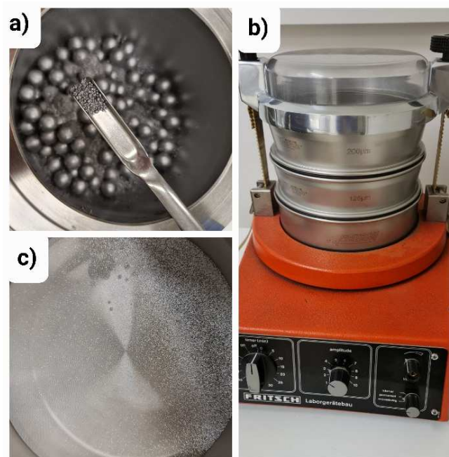
Figure 2 a) powder after mechanical milling at milling vessel, b) vibrating mill FRITSCH with sieves, c) powder after sieving (in Institute of Physics, Faculty of Science, P. J. Šafárik University in Košice)

After the preparation of powdered samples (Figure 2, a) by mechanical milling in planetary ball mill (Figure 1) we used a vibrating mill (Figure 2, b) to sieve a powder fraction and to select powder with fraction smaller than 400 \mu\text{m} . So we prepared powder samples with required mechanical properties (Figure 2, c).