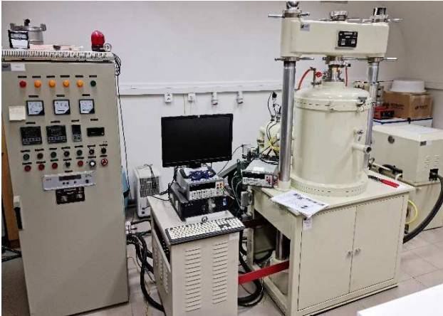
Figure 4 LTVAT ZT-25-20Y machine for the compaction (in Institute of Physics, Faculty of Science, P. J. Šafárik University in Košice)

25-20Y (Figure 4) pressing apparatus, which allows the compaction at temperatures up to 1000 °C.