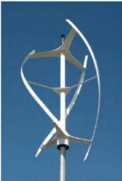
Figure 1 Wind turbine type Triple-Helix Quietrevolution [10]

Projects, where the existing buildings were fitted with urban wind turbines, are not always feasible or returnable, but if the design of the building was counting with the possible implementation of wind turbines from the beginning, the results might be better. Concerns about noise, vibration and energy yield can be eliminated, if there is properly conducted evaluation of the wind and application of the correct wind turbine at optimum mounting location. It is said that the wind turbine with a vertical axis of rotation, type Triple-Helix Quietrevolution (QR) (Figure 1), is ideal for urban environments. It is rated at 6 kW, produces 10,000 kWh/year at average wind speeds, it is free standing at approximate height of 14 meters with a span of 3 meters. If it is placed on a building, sufficient height for mounting is 8 meters. Moreover, it is profitable, which makes it attractive for business and building developers.