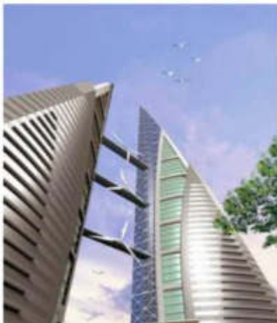
Figure 3 Bahrain World Trade Centre [6]

Bahrain World Trade Centre is designed to collect and compress the wind flow between the two towers, where is the wind turbine with a horizontal axis of rotation placed (Figure 3). Narrowing of the Bahrain World Trade Centre, results in increased wind speed at the location of the turbine up to 30%, resulting in the supply of electricity from turbines in the range of 11-15% of the needs of the building [6]. The same effect of narrowing is implemented on Pearl River Tower, where the building has four large openings, approximately 3 x 4 meters wide. The facade is shaped so as to reduce the forces of resistance and optimize the rate at which wind flows through these openings. These openings act as pressure valves for the building.