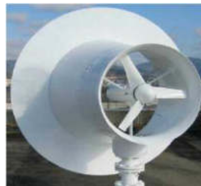
Figure 4 Example of the diffuser-augmented wind turbine [6]

During the development, since '70s turbine blades were placed inside the housing profile and prototypes were developed at the University of Rijeka, in Croatia, where the stated yield of such an arrangement of the turbine is increased by 60% as compared to freestanding wind turbines. This is attributed to accelerating effect of the profile that allows the turbine to operate at lower wind speeds, as it collects more wind from different sides and leads it directly to the turbine blades.