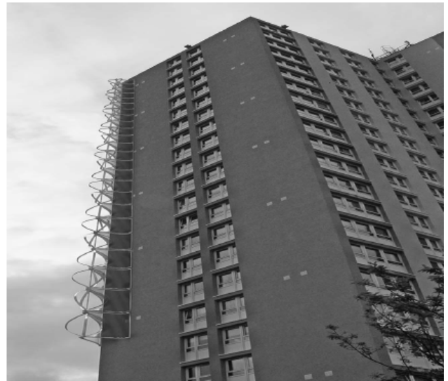
Figure 2 Crossflex concept and its mounting [9]

can be placed on the corners of buildings for generating useful energy level.